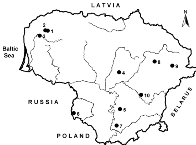
Fig. 1. Location of the study sites in Lithuania: 1 – Kreiviškės, 2 – Plikoji sala, 3 – Minijos kilpa, 4 – Šilas, 5 – Gojus, 6 – Drausgiris, 7 – Subartonys, 8 – Ažuolija, 9 – Ginučiai, 10 – Dūkštos

stands of various age groups from maturing (50–120 years) to mature (over 120 years). Depending on the size of a study site, from one to nine circular study plots of 0.1 ha were randomly selected. In total, we surveyed 50 plots.